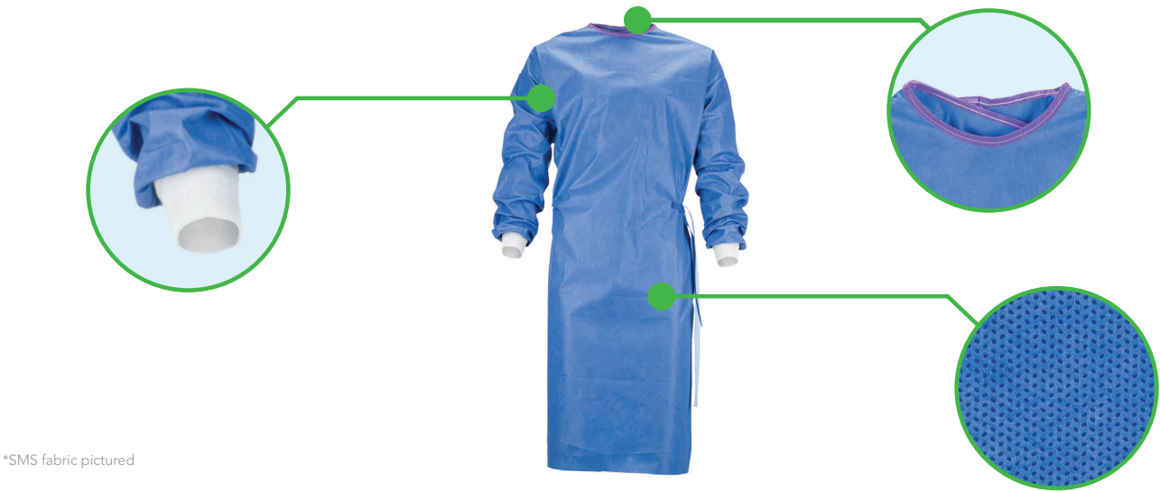
*SMS fabric pictured