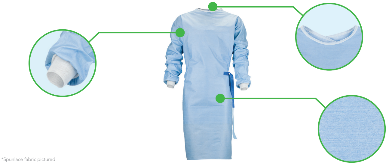
*Spunlace fabric pictured